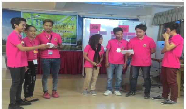
The SSC Officers during their activity in the Leadership Training