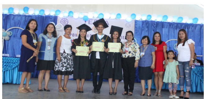
Proud graduates as they receive their awards together with their families.