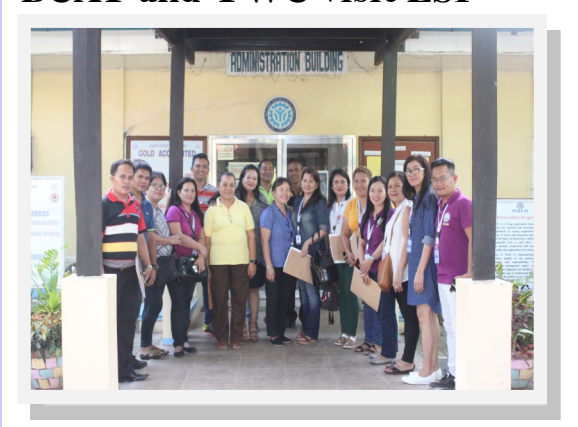
The Balicuatro College of Arts and Trades APACC Criterion Champions with their LSF Counterparts

The officials and staff of both the Balicucatro College of Arts and Trades and the TESDA Women's Center paid a visit to Lupon School of Fisheries as part of their preparations for the Asia Pacific Accreditation and Certification Commission (APACC) reaccreditation.