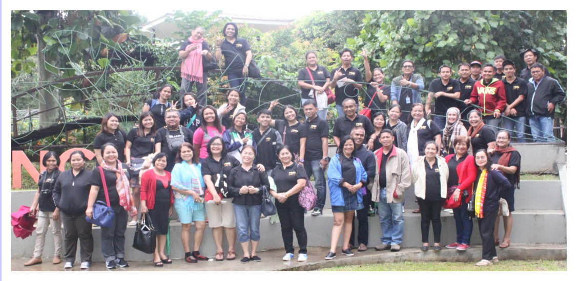
The Lupon School of Fisheries Faculty and Staff at Malagos Garden Resort during the two-day Mid Year Performance Assessment

From the get-go, the faculty and staff of Lupon School of Fisheries, including its JOs never expected a conference-like Mid-Year Performance Assessment 2017 or MYPA 2017.